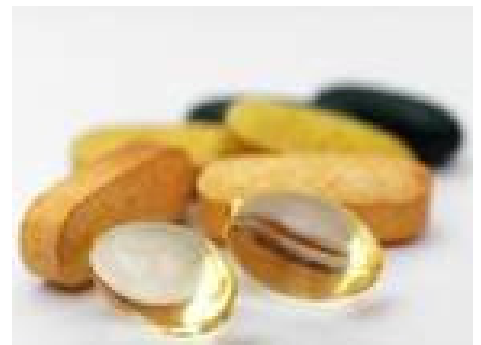
Not all supplements are created equally.

it must be supported by the appropriate research. The shelves of the health food stores are changing and supplements available within are under the same scrutiny as the "professional" supplements, thereby providing the consumer with increasing protection. Where care must be taken is in purchasing supplements through multi-level or internet marketing—particularly internet marketing. If the product was manufactured in the US, keep in mind it has not likely undergone the same testing as those made in Canada. Even if the product was made in Canada, it has not necessarily been approved by Health Canada, and could prove to be a danger. One recent example is